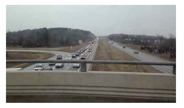
Figure 2: Rush hour